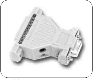
KO945 adapter with terminals for easy connection of signals