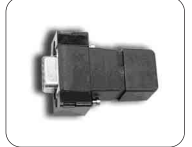
KO921 watertight connector - IP67