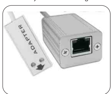
LAN adapter LPO05