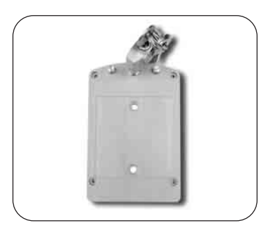
F9000 wall holder with lock